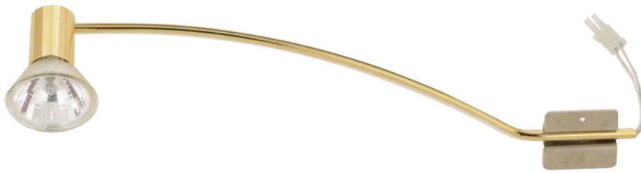
Cornice Light , with fixed head Rod Ø 6 mm ( \frac{1}{8} "") Finish: steel

Length: 330 mm (13") Height: 95 mm (3 \frac{3}{8} ")