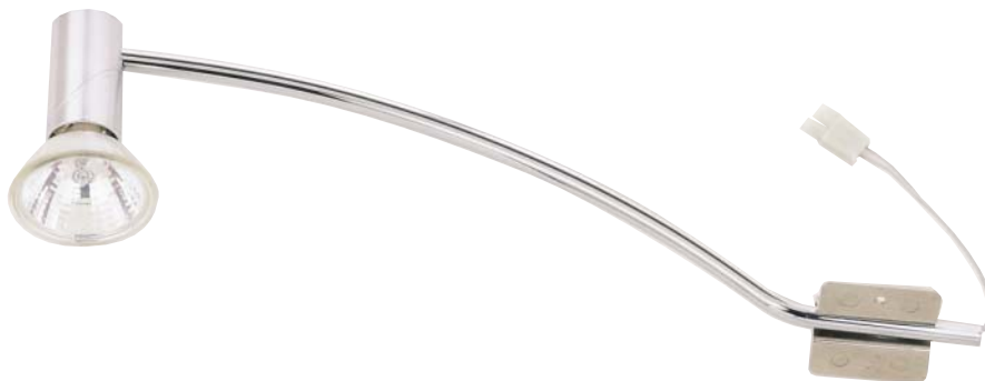
Cornice Light , with adjustable head Rod Ø 8 mm ( \frac{5}{16} "") Finish: steel

Length: 330 mm (13") Height: 99 mm (3 \frac{7}{8} ")